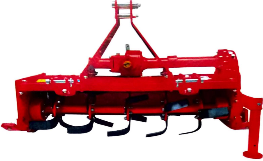
MASCHIO GASPARDO ROTARY TILLER, Model: WIND 105 (Chain Drive) (Tractor Operated)