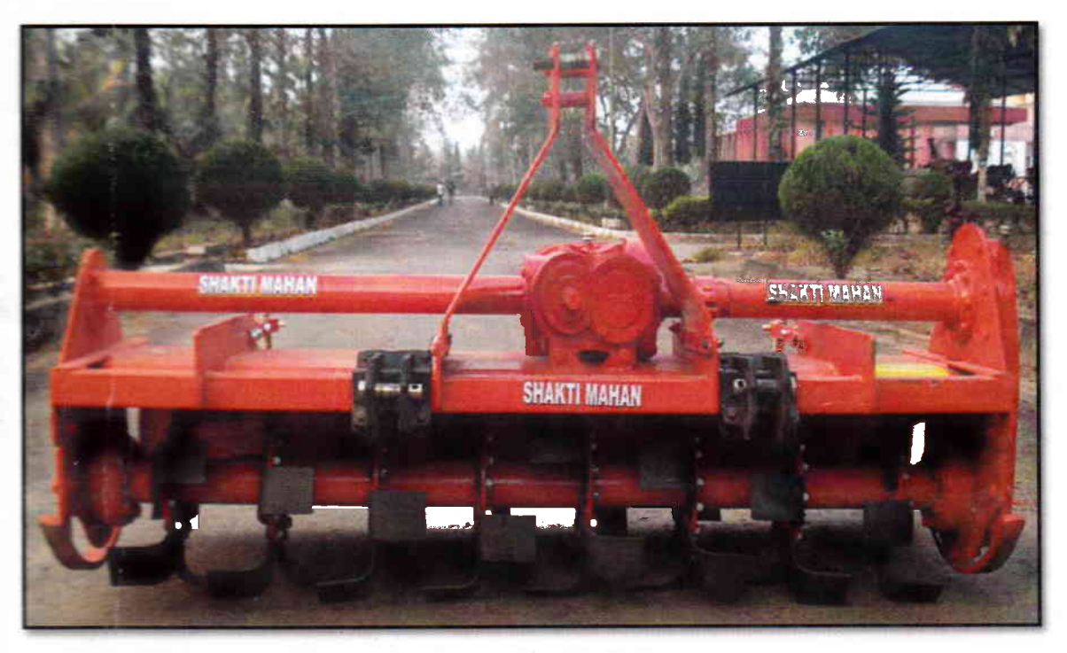
Shakti Mahaan (SMR-7) Rotavator