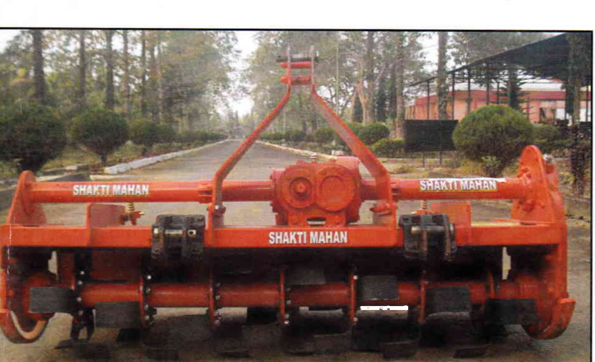
Shakti Mahaan (SMR-6) Rotavator