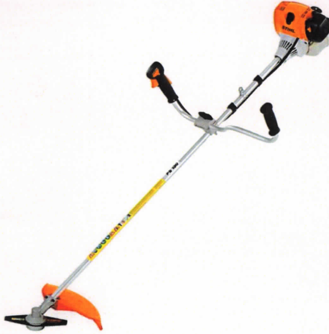
“STIHL, FS-130” BRUSH CUTTER (Self Propelled)

FMTTI (NER), LIBRARY No. 3348 DATE 15-11-19