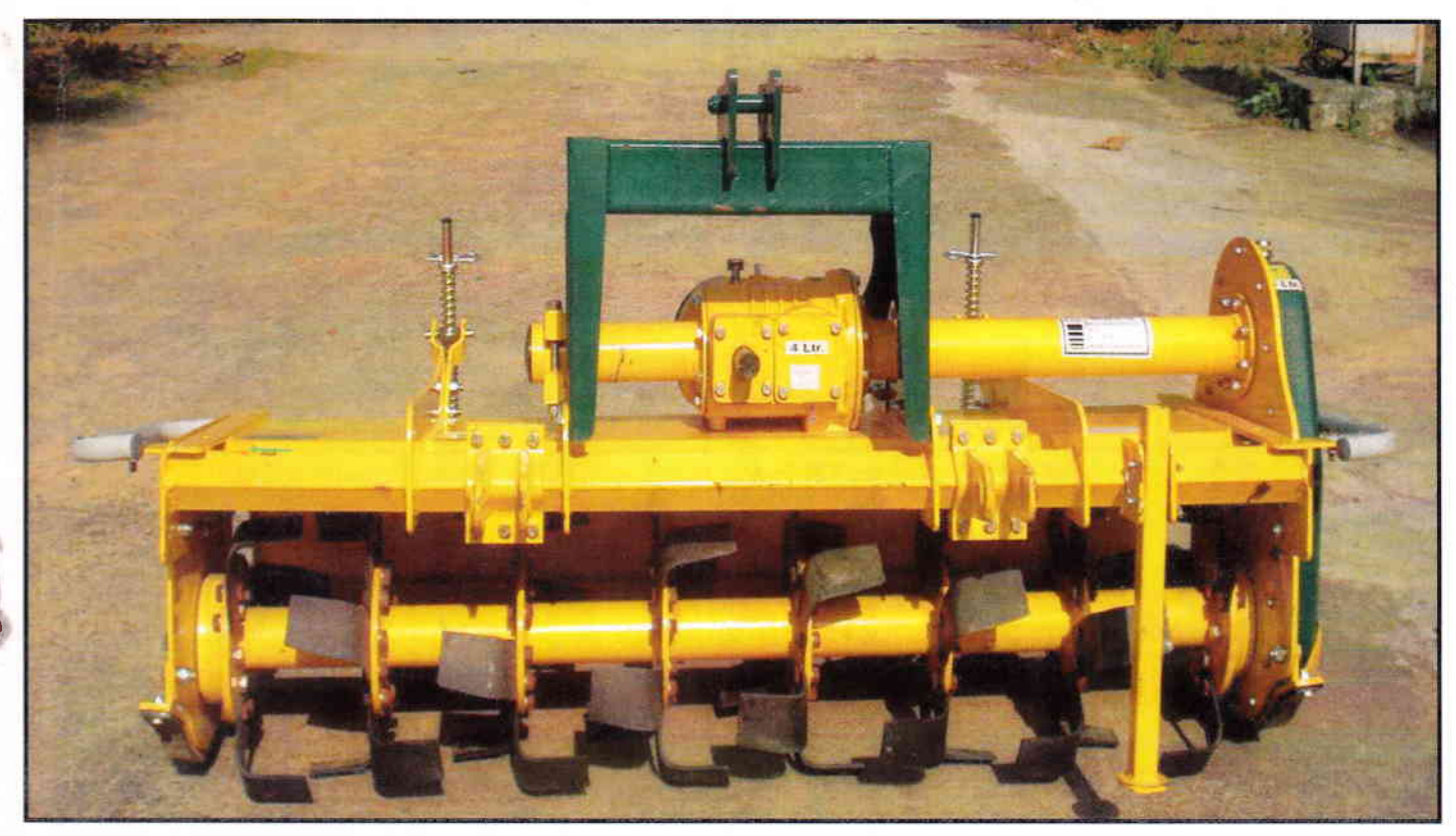
New Swan (NSE RT 175) "Super Series" Rotavator

संख्या / No. : Imp.138/186 माह / Month: August, 2013