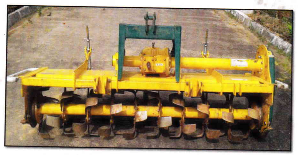
New Swan (NSERT 225) Super Series Rotavator