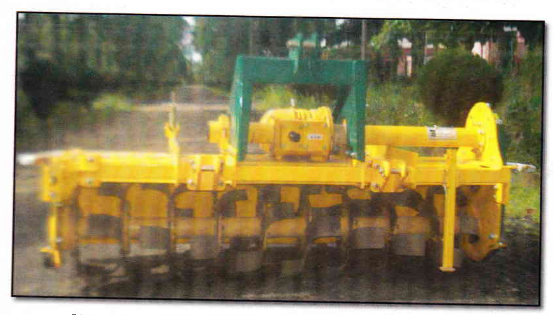
New Swan (NSERT 200) Super C Series Rotavator

संख्या / No. : Imp. No. 163/214 माह / Month: October, 2014