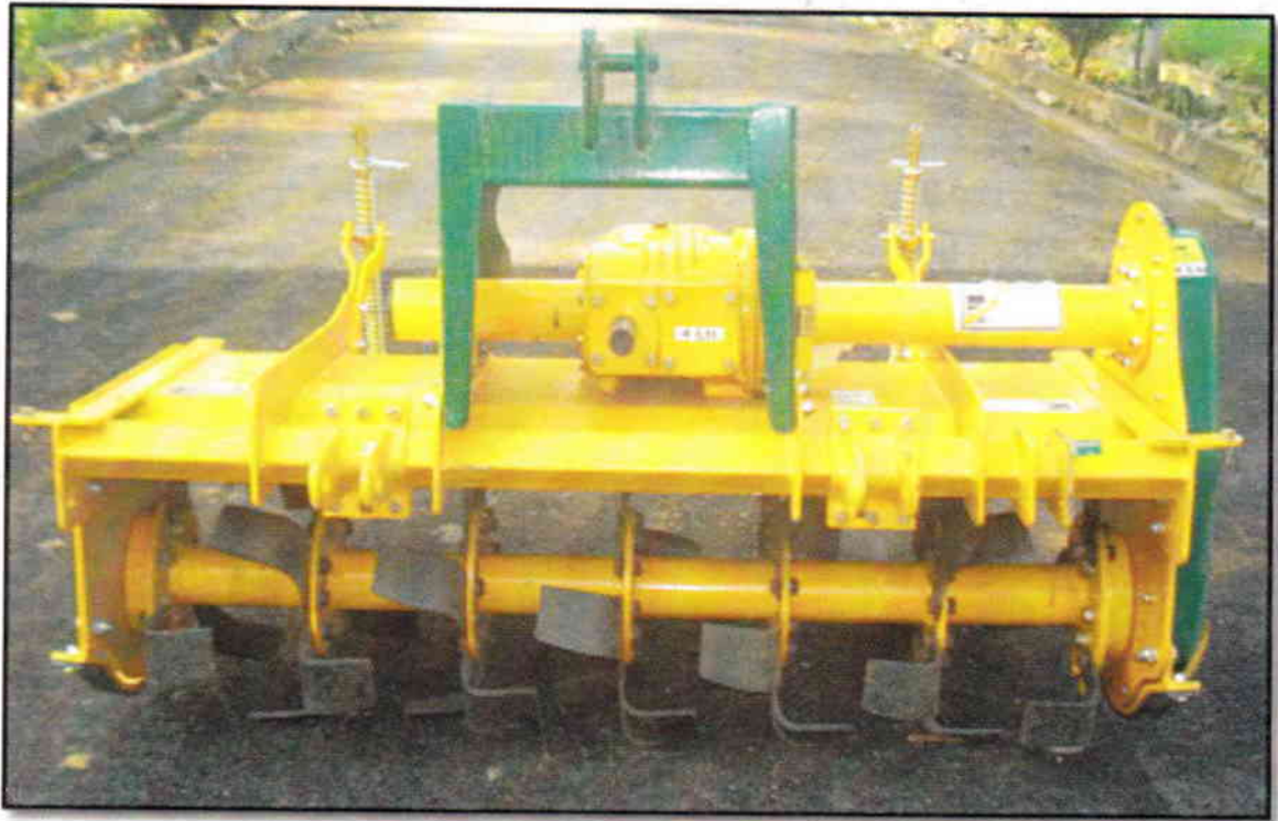
New Swan (NSERT 150) SS Rotavator