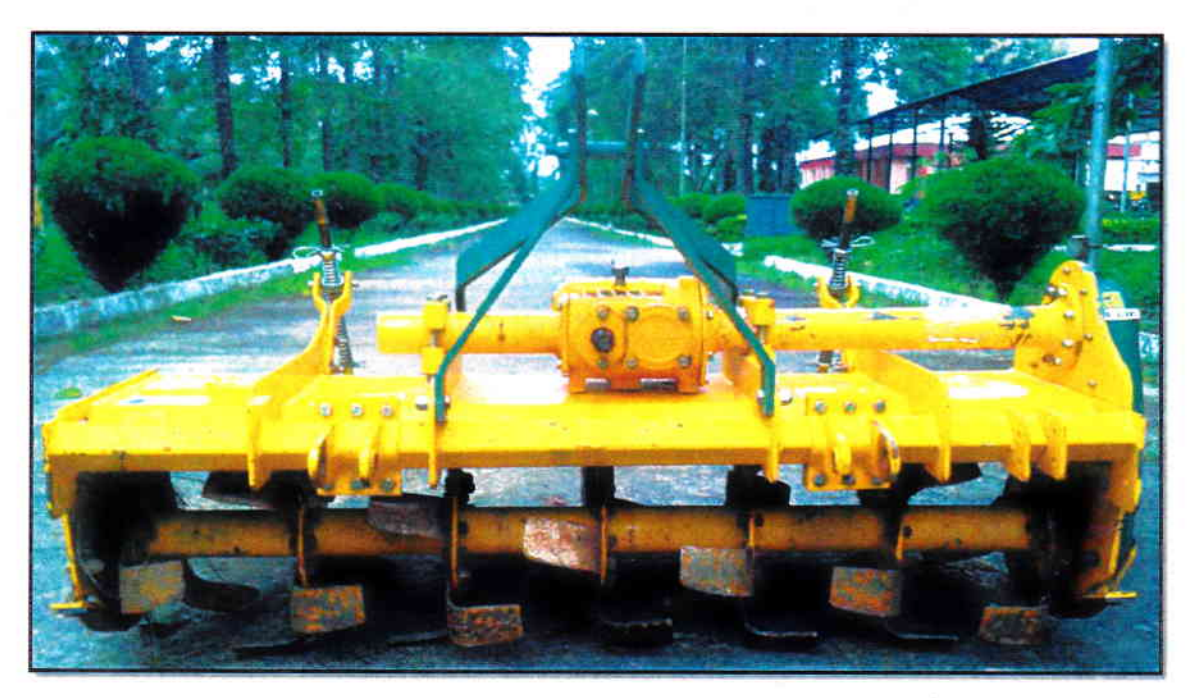
New Swan (NSERT 150) Jet Series Rotavator

संख्या / No. : Imp. No. 160/211 माह / Month: September, 2014