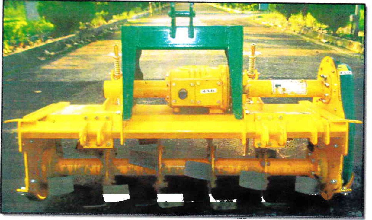
New Swan (NSERT 125) Rotavator