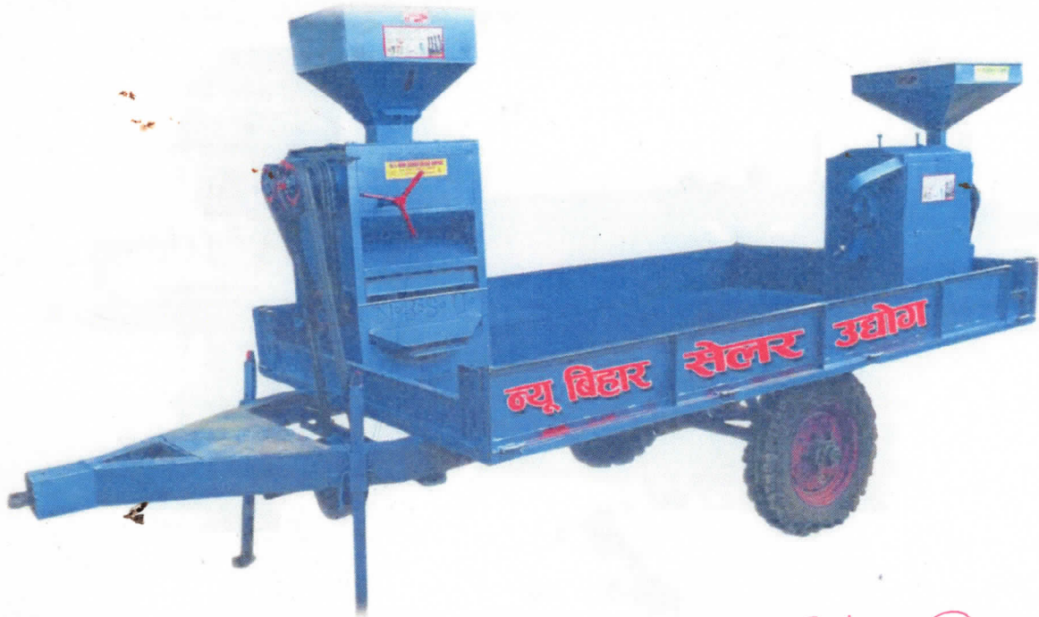
NBSU Mini Rice Mill

संख्या / No. : Machine No. 22/215 माह / Month: November, 2014