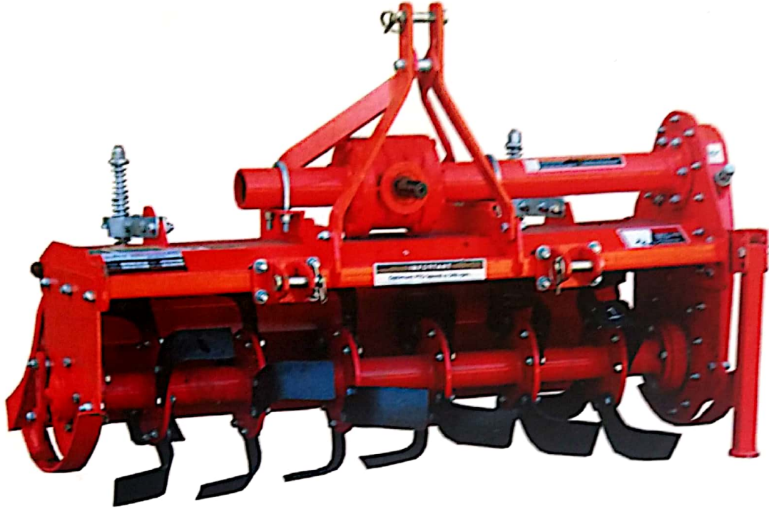
LANDFORCE, ROTARY TILLER Model: RNMSGHAMC (Gear Drive) (Tractor Operated)