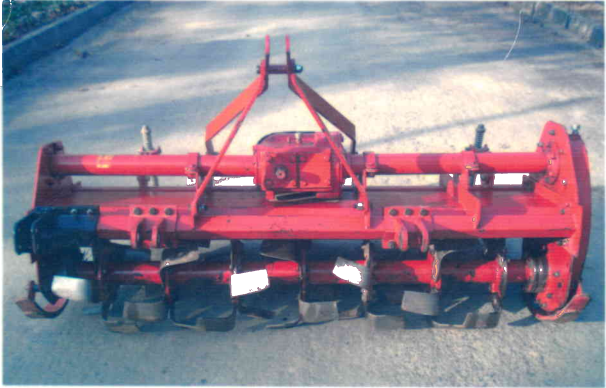
HARNEK ROTAVATOR (TRACTOR MOUNTED)

संख्या / No. : Imp.120/167 माह / Month: January, 2013