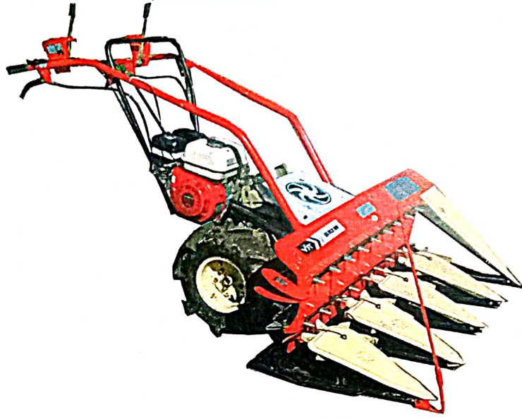
55 DLX-HW VST SELF PROPELLED REAPER

THIS TEST REPORT IS VALID UPTO 31.08.2027