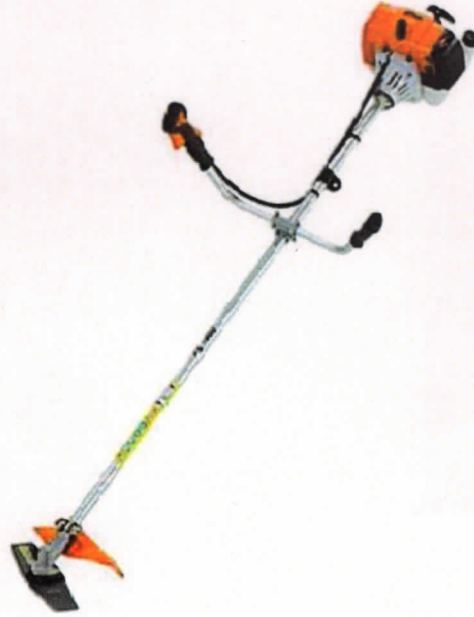
“STIHL, FS-3900” BRUSH CUTTER