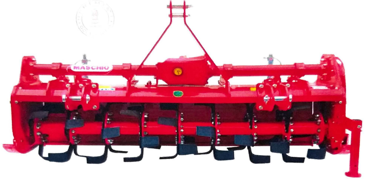
MASCHIO GASPARDO ROTARY TILLER, Model: VIRAT PLUS 165 CENTRALLY MOUNTED, GEAR DRIVE, MULTI SPEED