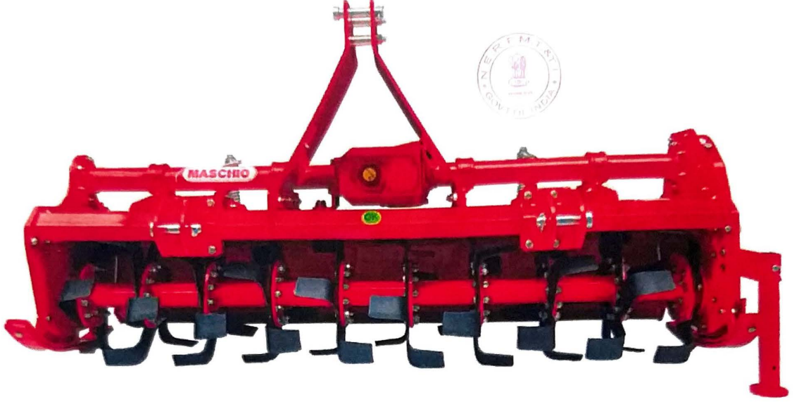
MASCHIO GASPARDO ROTARY TILLER, Model: VIRAT LIGHT 185 CENTRALLY MOUNTED, GEAR DRIVE, MULTI SPEED