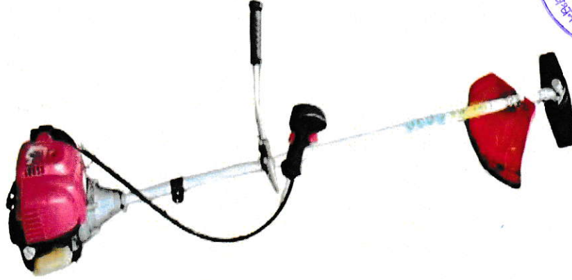
TOSFL TFGC35 BRUSH CUTTER