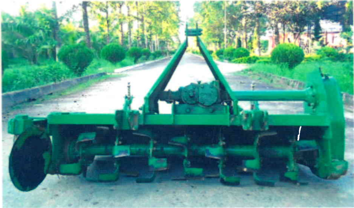
HIRA -677 ROTAVATOR (TRACTOR MOUNTED)

संख्या / No. : Imp.123/170 माह / Month: January, 2013