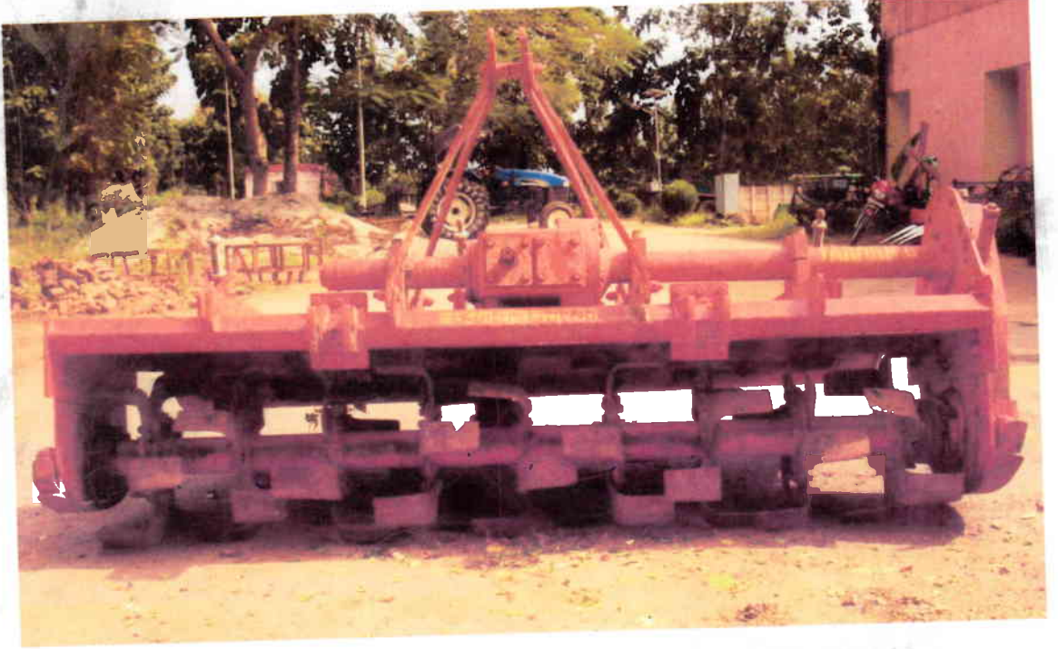
FARMKING FKRT-20048 ROTAVTOR (TRACTOR OPERATED)

संख्या/No. : Imp. 76/116 माह /Month : October, 2010